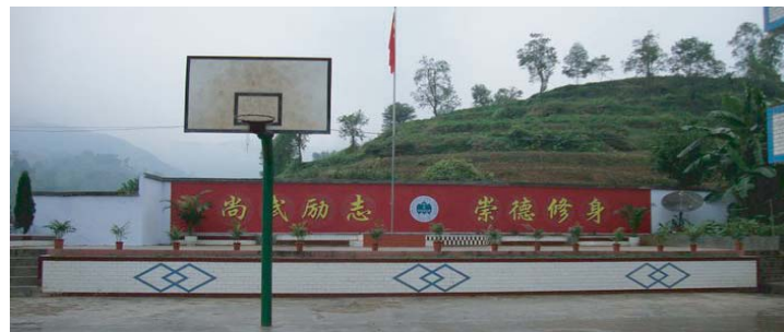
嶄新的升旗台與籃球場 Brand New Courtyard

欣欣教育基金會的最終目的是希望中國偏遠地區的學童們均有較佳的讀書環境。除了改建與修葺校舍外，基金會還提供後續基金為學校進一步的充實軟硬件內容，改變教學環境，並提高教學素質。基金會為欣欣學校維修教室、校園、操場、廚房、飲水設備、屋頂、食堂、宿舍及廁所；添置辦公室桌椅、學生課桌椅、黑板、書櫃及學生床；加上運動器材、多媒體設備、音樂美術舞蹈設備及科學器材，使學生有更完美的學習經驗。每所欣欣學校均可申請，經過嚴格審核後發放款項。欣欣自2005年起即開始為欣欣學校購買電腦，期望欣欣的孩子們可以藉著電腦與網路走出山區，接觸到更遠闊的世界。我們今年又送了電腦給二十四所學校。感謝個人捐款者與谷歌公司提供的善款，超過三十萬的資金送到了一百多所欣欣學校。