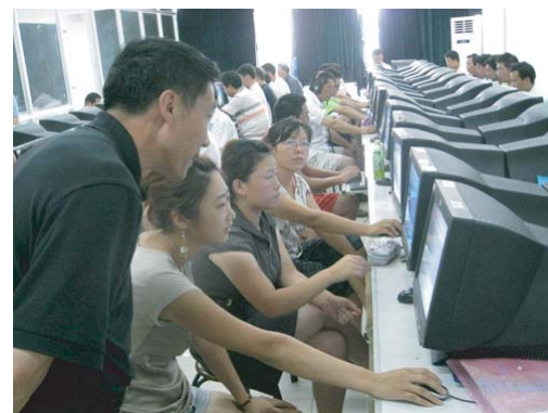
欣欣電腦老師培訓班 Computer Teachers' Teaching

今年是我們第六年舉辦英語師資培訓，第一次舉辦電腦師資培訓。今年的師資培訓於七月三日至八月十四日在湖南省長沙市湖南科技職業學院舉行。這次為期六週的培訓項目宗旨是為全國欣欣小學教師們提供培訓，幫助他們改進英語和電腦應用教學的技能，及具備現代化資訊及圖書管理技能。我們今年一共培訓了來自一百五十四所欣欣小學的一百七十八名教師，其中有八十一名參加了英語培訓，一百零四名參加了電腦培訓。英語培訓開設課程包括口語，聽力，閱讀，精讀，寫作，教法，電腦教學，實踐課，專家講座等。電腦培訓開設課程包括網路基礎教程，局域網組建與維護實用教程，電腦常用工具軟體教程，辦公實務：包括Microsoft Office的使用與製作等；以及電腦英語。