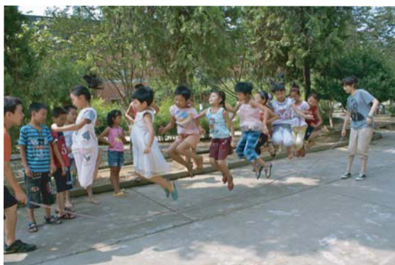
清華大學學生在湖南舉辦的夏令營 Summer Camp by Tsinghua University Students

By partnering with three local Chinese universities, a select group of college students were able to visit Shin Shin schools in the summer of 2010. 12 students from Peking University visited 15 Qinghai schools to survey the school's current condition and to understand the effect of Shin Shin's programs; 24 students from Tsinghua University visited one Hunan school, conducted a two-week summer camp that included language, speech, writing, math, computer, English, art and physical education; 28 students from Fudan University visited seven Hunan schools, taught teachers basic computer application and maintenance skills, and use of multimedia equipment for teaching. This program increased our understanding of Shin Shin schools, motivated Shin Shin students to learn, and provided tools to help the teachers. For those college students, this program gave them first hand experience and insight into the life of children in these remote regions, which heightened their desire to do more to help the disadvantaged children.