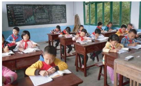
New Desks and Chairs in the New Classroom