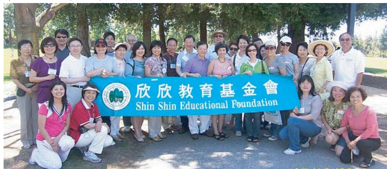
Shin Shin Volunteers at the Annual Picnic Event