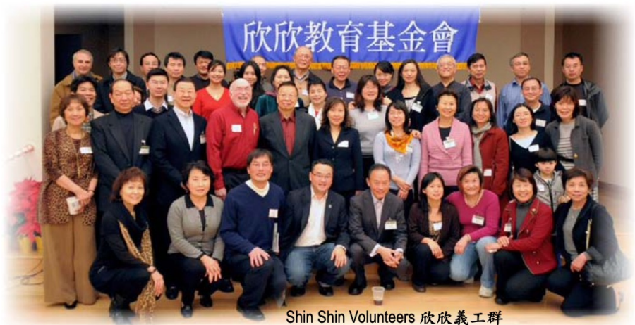
Shin Shin Volunteers 欣欣義工群

北京代表處尚處在發展初期，也被大家寄予厚望，接下來，代表處將開始建立並保持與主管單位、合作方、教育機構、專家、學校和僑辦的聯絡溝通。對於基金會的專項工作，如ECTT、圖書計劃、eLearning等，提供支持服務。在中國積極招募更多志同道合的義工壯大我們的隊伍。並發揚欣欣回饋社會的服務精神。希望能夠讓欣欣教育基金會在中國的教育慈善事業上取得更大成功。我們本著腳踏實地的發展理念，堅定不移的實現欣欣人的長遠目標。