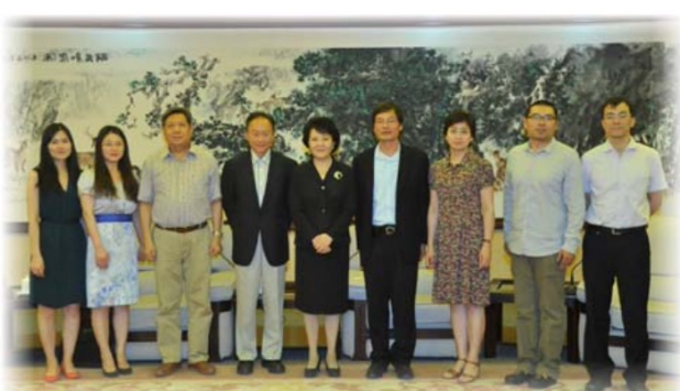
Shin Shin met with Director Qiu Yuanping of Overseas Chinese Affairs Office of the State Council